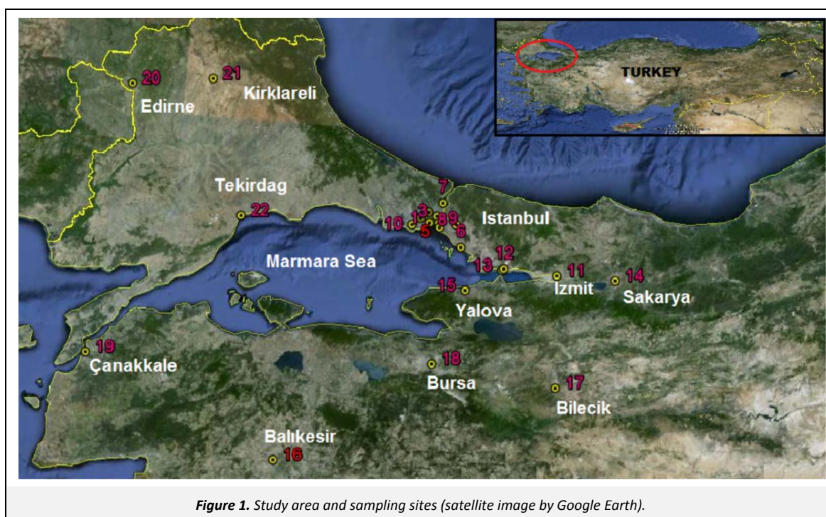
Figure 1. Study area and sampling sites.

PCA. PCA, proposed by Pearson (1901), is a multivariate, statistical and exploratory analysis method. In this method, so-called principal components (PCs) are used to transform a set of interrelated variables into a set of uncorrelated variables (Pires et al., 2008; Lau et al., 2009; Moreno et al., 2009; Lu et al., 2011; Ozbay, 2012; Hu et al., 2013). These PCs are linear combinations of the original variables and are obtained in such a way that the first PC explains the largest fraction of the original data variability. The second PC explains a lesser fraction of the data variance than the first PC and so forth (Pires et al., 2008; Lau et al., 2009).